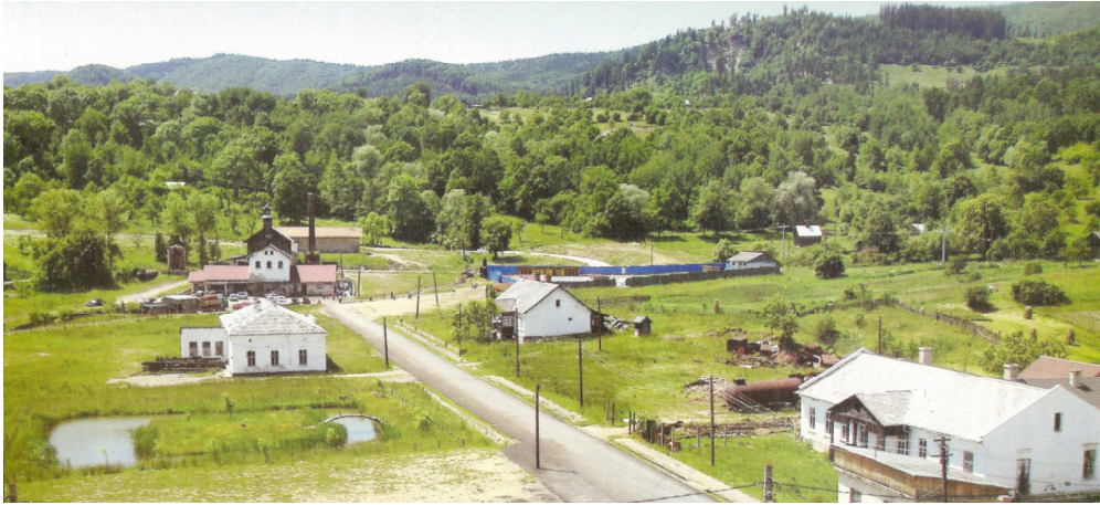
Figure no 4: Enclosure landscape nature of Cacica Mine

However, the undergrounds of the salt mine, several centuries old, the Sf. Varvara Catholic Chapel, (figure no.5), protector of miners, located at a depth of 27 m and the galleries, take one to the small salty underground lake of 12 / 8 m and deep of 1.5-2 m,