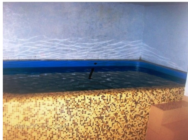
Figure no 3. New therapy of Cacica Mine

The new salt mine, (figure no.3) 3 km away, on the territory of neighboring commune, Partesti de Jos, used in the technological process hyper-concentrated water resulting by dissolving it deep inside the salt mine, by vacuum spraying, thus acquiring the best recrystallized salt. The modern “Minorities Complex” uses the same well salty water, after hydrolysis, sand-filters purification and ozone disinfection process.