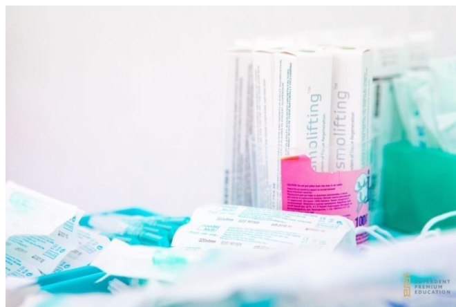
Fig.2 Plasmolifting tubes

- Apyrogenic, sterile, 9 ml vacuum tubes , made of medical glass and covered on the inside, at the top and middle, with a microdispersion of sodium heparin, and at the bottom - a separating gel (thixotropic)..