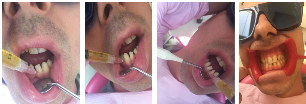
Fig 14. Platelet injections rich in platelets in periodontal disease