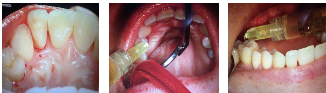
Fig 15. Platelet-rich platelet injections in periodontal disease, the injections in the periodontal pouch