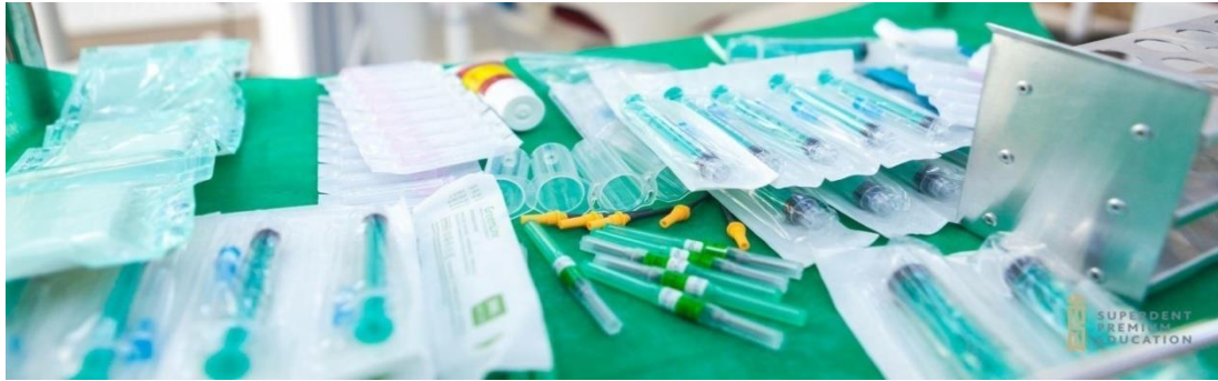
Fig 3. Venous blood collection instruments