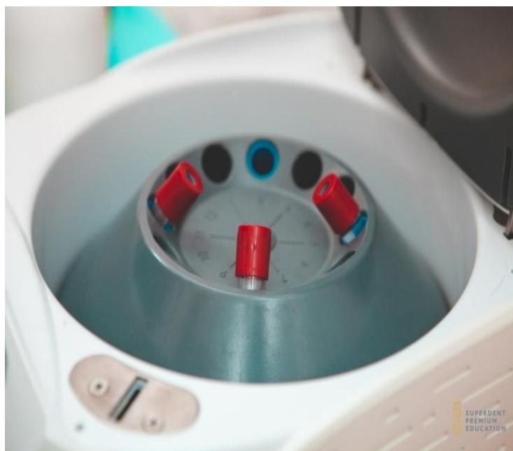
Fig.5 How to arrange a test tube in the centrifuge

The tubes are arranged in the centrifuge, the centrifuge is set according to the manufacturer's instructions. 3500 rpm - 5min