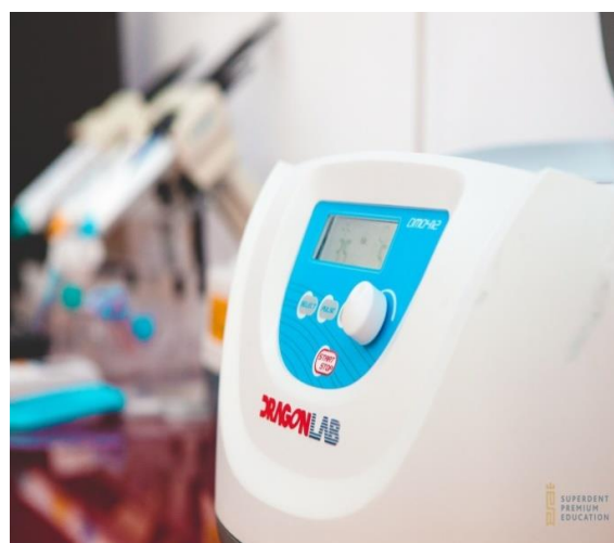
Fig 6. Number of rotations and spin time