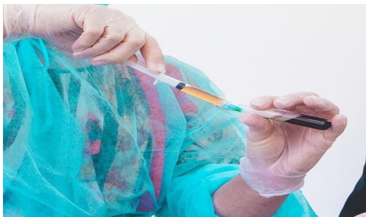
Fig 10. Plasma harvesting from the tube 2