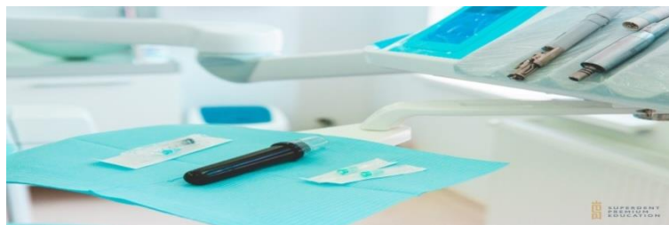
Fig 8. The step in which the vial is removed from the centrifuge

Using a 2-3 ml syringe, collect platelet-rich plasma that is at the top of the tube above the separating gel.