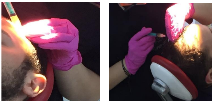
Fig.13 Platelet-rich platelet injections in the scalp