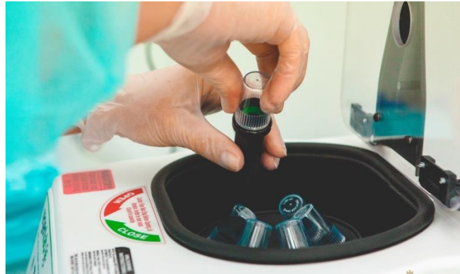
Fig 7. Finish the spin cycle

Using a 2-3 ml syringe, collect platelet-rich plasma that is at the top of the tube above the separating gel.