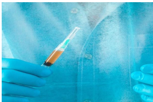
Fig 11. Plasma harvesting from the tube 3