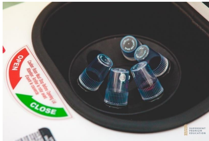
Fig.1. Centrifuge for plasma preparation

- Centrifuge (centrifugal force 3200 rpm)