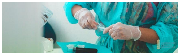
Fig 9. Plasma harvesting from the tube 1