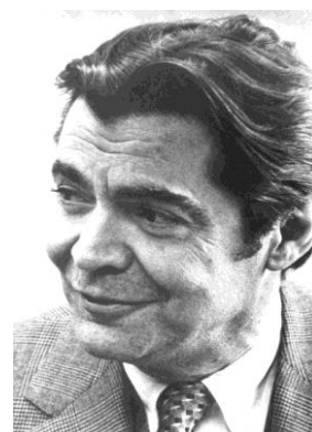
George Emil Palade (1912 – 2008) discovered the ribosomes and their cell functions