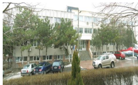
Fig. 10. National Institute for Marine Research and Development “Grigore Antipa” Constanța

The main responsibilities of NIMRD at national and international levels, carried aut with its research vessel