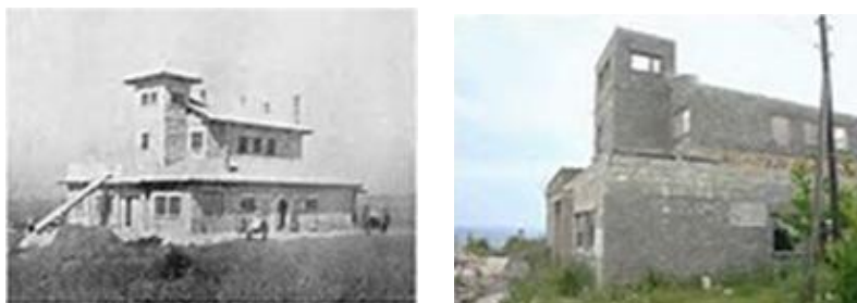
Fig. 9. The former marine biological station of Caliacra currently in ruins.

When Caliacra county, together with that of Durostor, was part of Great Romania's south eastern part of Dobrogea called the 'Cadrilater' ('Quadrilateral'), lost to Bulgaria in 1940, G. Antipa founded a Marine Biological Station near Cape Caliacra (Fig. 9). There has not been much testimony left about the work and/or results of this obsolete Romanian scientific establishment.