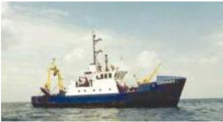
Fig. 11. Research vessel "Steaua de Mare 1".