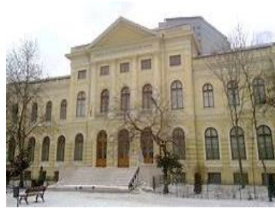
Fig. 7. The National Museum of Natural History „Grigore Antipa” in Bucharest.

G. Antipa founded and became afterwards director of the National Museum of Natural History, in Bucharest, in 1934 (Fig. 7), which he led for 51 years, introducing for the first time the concept of <diorama>, artistically carried out, in museology, namely the presentation of the fauna in its natural environment; the way of organization was taken over mainly in North America (xxx, 1975; Zamfirache, 2018).