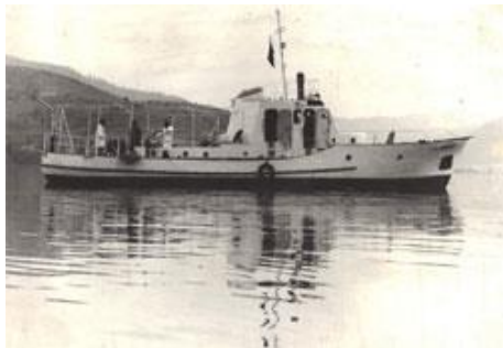
Fig. 5. The research vessel Racovitza of the MZS at Agigea.