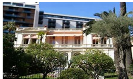
Fig. 2. The premises of the International Commission for the Scientific Exploration of the Mediterranean Sea in Monte Carlo (Monaco).

Another eloquent example of the recognition accorded to Romanian marine research is the over ninety-year cooperation between Romania and the Mediterranean