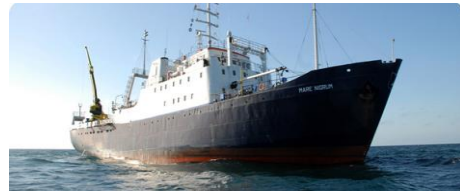
Fig. 13. Research vessel Mare Nigrum .