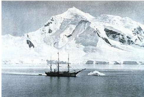
Fig. 1. The Belgica anchored at Mount William