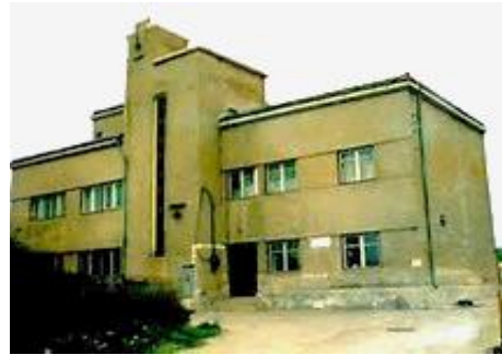
Fig. 8 The Bio-oceanographic Institute in Constanța

He is the author of the valuable monograph „ Marea Neagră, vol 1 Oceanografia, bionomia și biologia generală a Mării Negre ” („ The Black Sea, vol. 1 Oceanography, Bionomy and General Biology of the Black Sea ”) (Antipa, 1941), published by the Romanian Academy, in the "Vasile Adamachi" Fund.