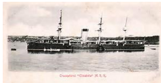
Fig. 6. The cruiser Elisabeta of the Romanian Royal Navy.

G. Antipa is another reference person in the study of the Black Sea and not only, a brilliant student of Ernst Haeckel (Popa et al. , 2017), the creator and promoter of ecology. He organized the first Romanian scientific expeditions