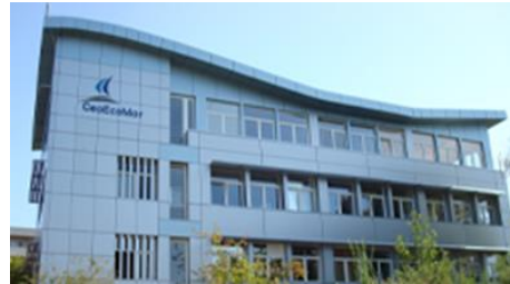
Fig. 12. National Institute for Research and Development of Marine Geology and Geoecology, its premises in Constanța.