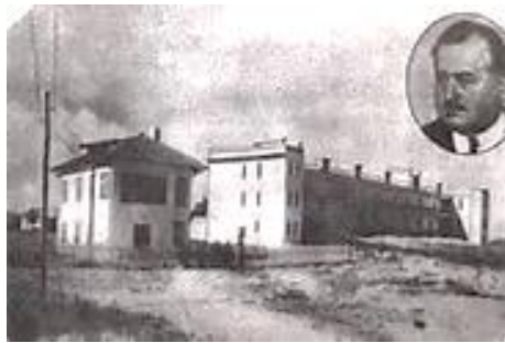
Fig. 4. The Marine Zoological Station „Professor Ioan Borcea”, Agigea.